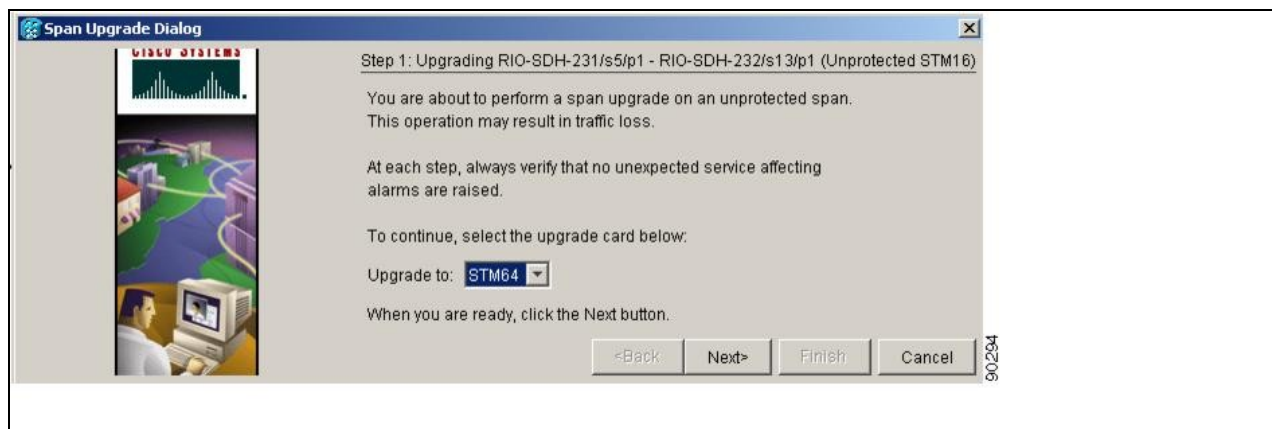
Figure 12-2: Span Upgrade Wizard

Caution! As indicated by the wizard, when installing cards you must wait for the cards to boot up and become active before proceeding to the next step.