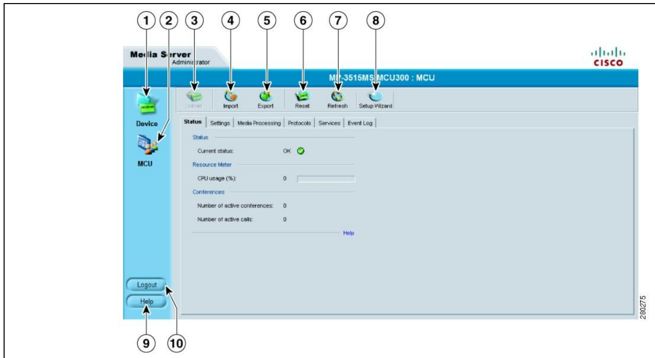
Table: MSA Interface Elements for the Cisco Unified MeetingPlace 3515 Media Server