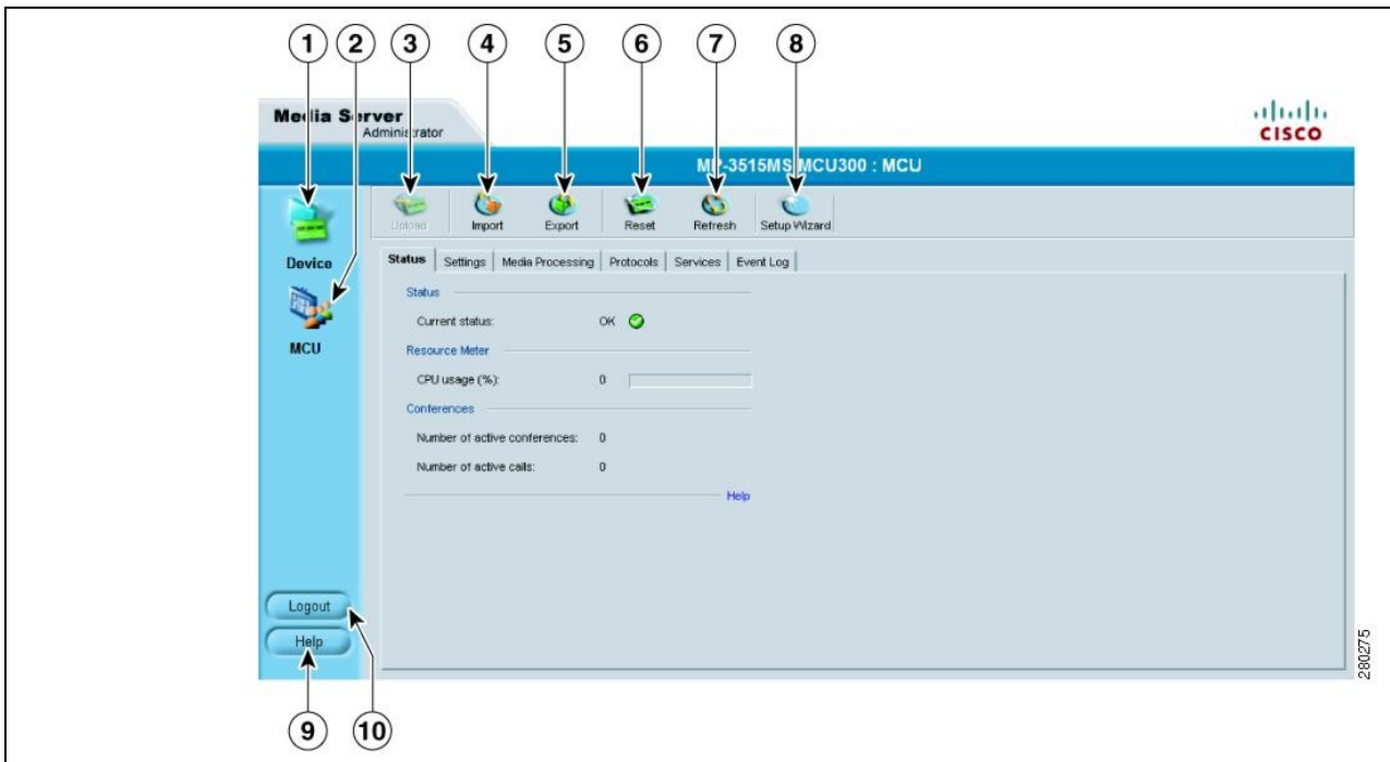
Table: MSA Interface Elements for the Cisco Unified MeetingPlace 3515 Media Server